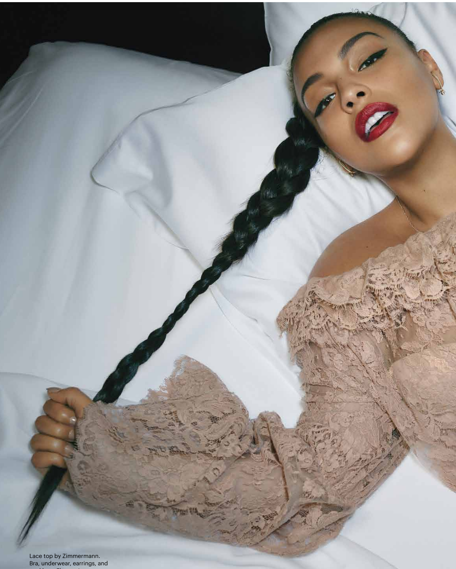
Lace top by Zimmermann. Bra, underwear, earrings, and necklace, Elsesser's own. Details, see Shopping Guide.