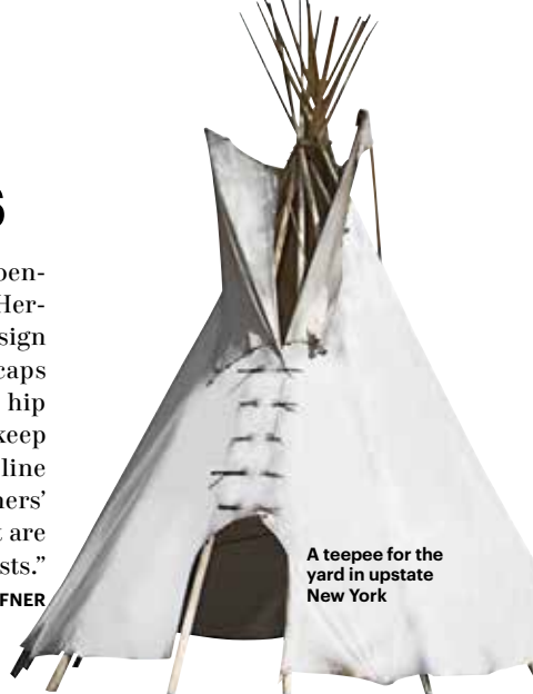
A teepee for the yard in upstate New York

10. A Newfoundland puppy. "Quite possibly our favorite thing in the whole world."