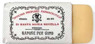
Santa Maria Novella soap, $18 (santamarianovella.com).