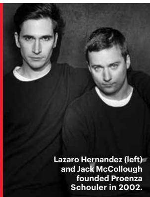
Lazaro Hernandez (left) and Jack McCollough founded Proenza Schouler in 2002.

1. Proenza Schouler leather jacket. "A spin on a classic motorcycle jacket but worked in a way that exaggerates the shape."