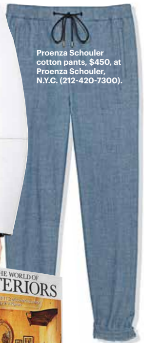
Proenza Schouler cotton pants, $450, at Proenza Schouler, N.Y.C. (212-420-7300).