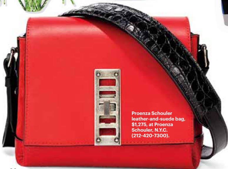
Proenza Schouler leather-and-suede bag, $1,275, at Proenza Schouler, N.Y.C. (212-420-7300).