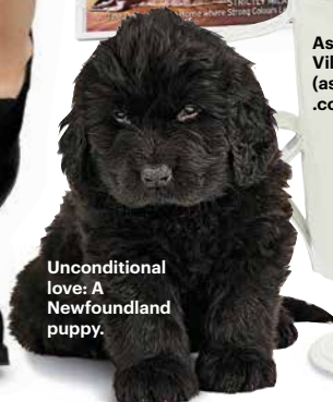
Unconditional love: A Newfoundland puppy.