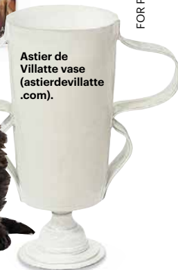
Astier de Villatte vase (astierdevillatte.com).

FOR PHOTOGRAPHERS' CREDITS, SEE CREDITS PAGE.