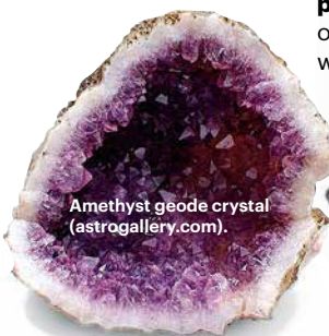
Amethyst geode crystal.