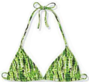
Proenza Schouler bikini, $245, at Proenza Schouler, N.Y.C. (212-420-7300).